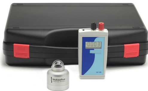
Figure 2 SR05-LI19 as it is delivered, in a practical transport case.